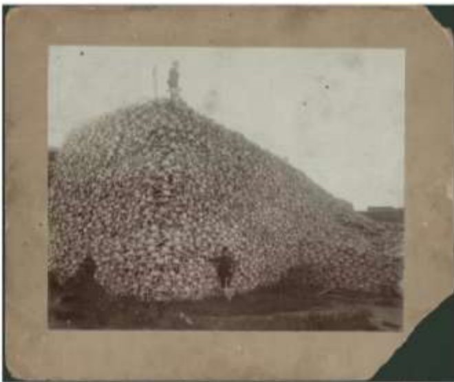
Men standing with pile of buffalo skulls, Michigan Carbon Works, Rougeville Mich., 1892.